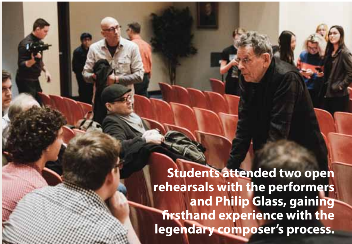
Students attended two open rehearsals with the performers and Philip Glass, gaining firsthand experience with the legendary composer's process.