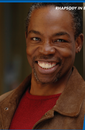
RHAPSODY IN BLACK