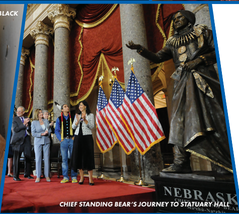
CHIEF STANDING BEAR'S JOURNEY TO STATUARY HALL