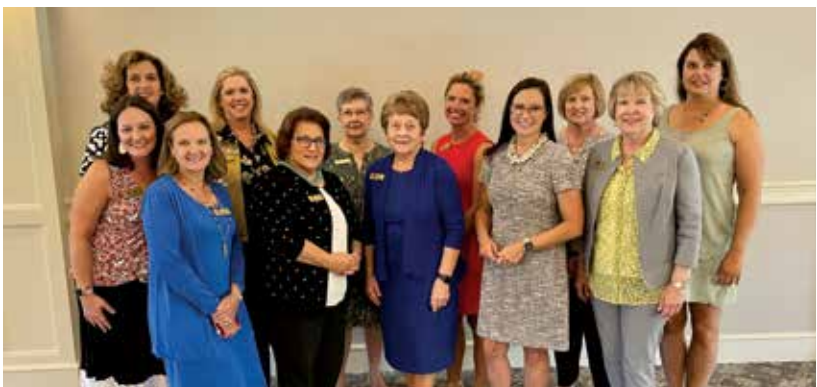
2021-22 Friends of Lied Executive Board Members

It was a wonderful day to reconnect with many old friends and make new friends!