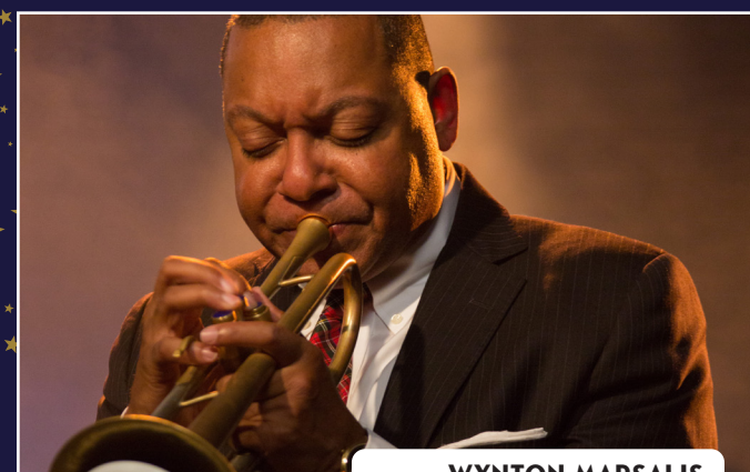
WYNTON MARSALIS OCTOBER 18, 2023

LIED CENTER CREATE YOUR OWN SEASON PACKAGES ON SALE NOW! ONLINE: LIEDCENTER.ORG PHONE: (402) 472-4747 IN PERSON AT THE LIED CENTER BOX OFFICE CHOOSE ANY FOUR OR MORE SHOWS AND RECEIVE A 20% DISCOUNT ON TICKETS