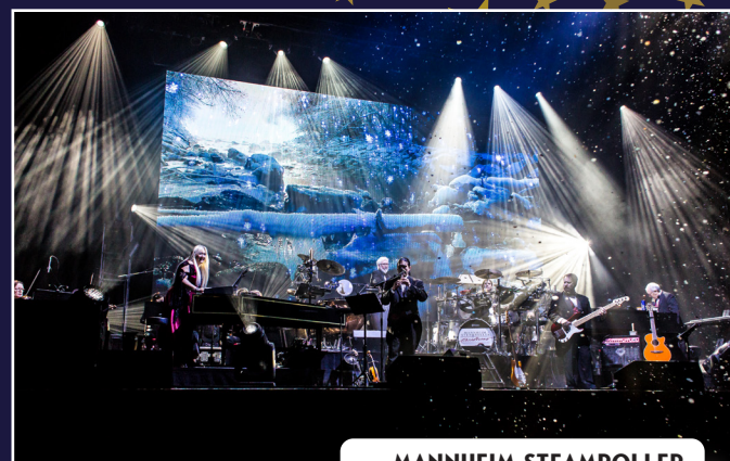
MANNHEIM STEAMROLLER DECEMBER 21, 2023