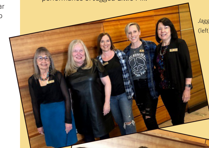
Jagged Little Pill (left)

Two final Pre-Performance Dinners were held by Friends of Lied this April. These fun, themed dinners take place right in the Lied Commons, giving attendees an easy way to catch dinner and a show for the April 1 performance of Cirque Alfonse: Animal - A Farm Story and the April 29 performance of Jagged Little Pill .