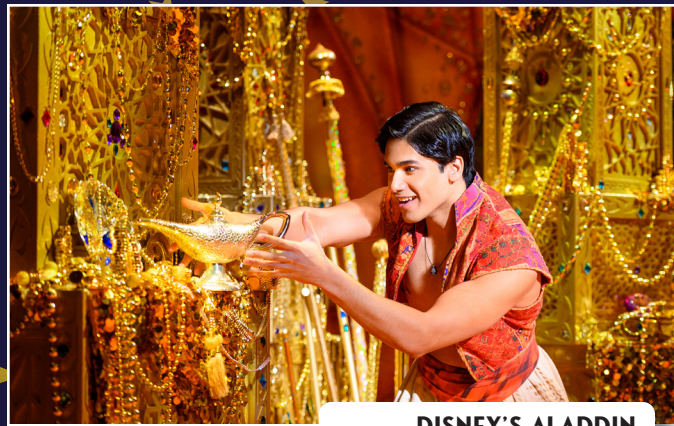
DISNEY'S ALADDIN OCTOBER 3-8, 2023