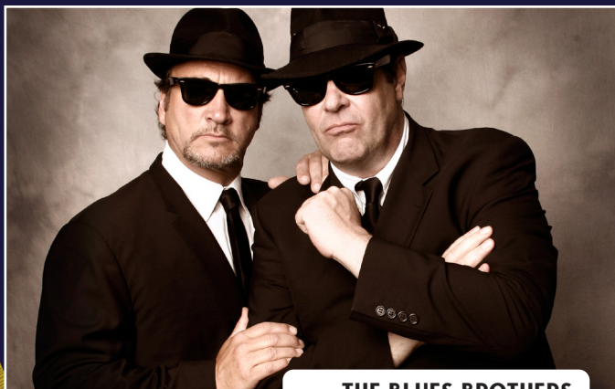
THE BLUES BROTHERS SEPTEMBER 22, 2023