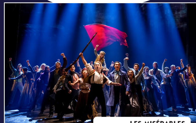
LES MISÉRABLES JANUARY 9-14, 2024