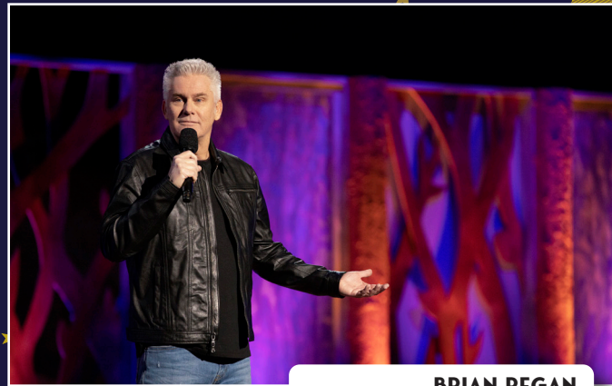
BRIAN REGAN APRIL 18, 2024