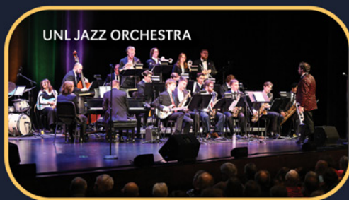
UNL JAZZ ORCHESTRA